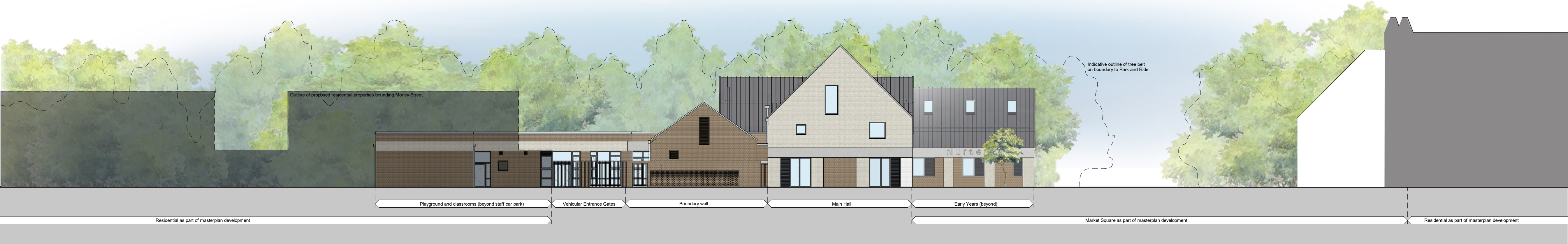
2 West Elevation 1 : 200