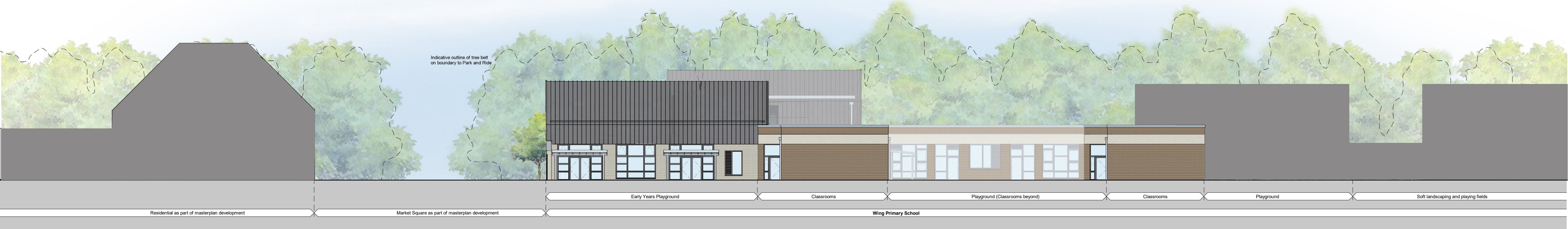
4 East Elevation 1 : 200