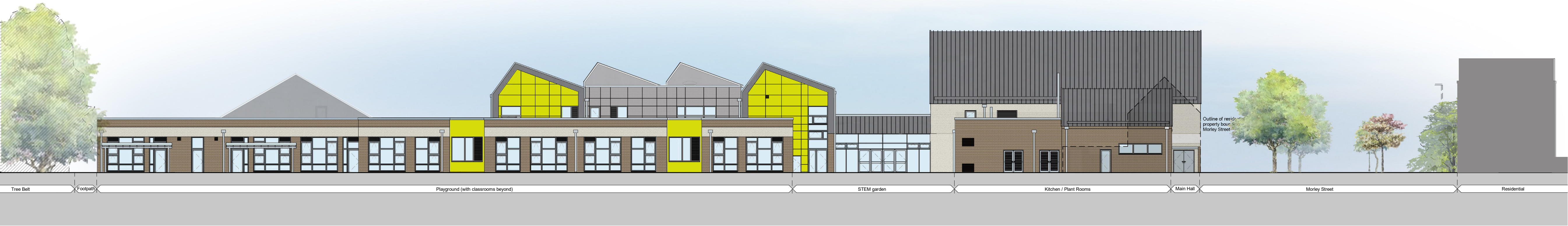
3 North Elevation 1 : 200