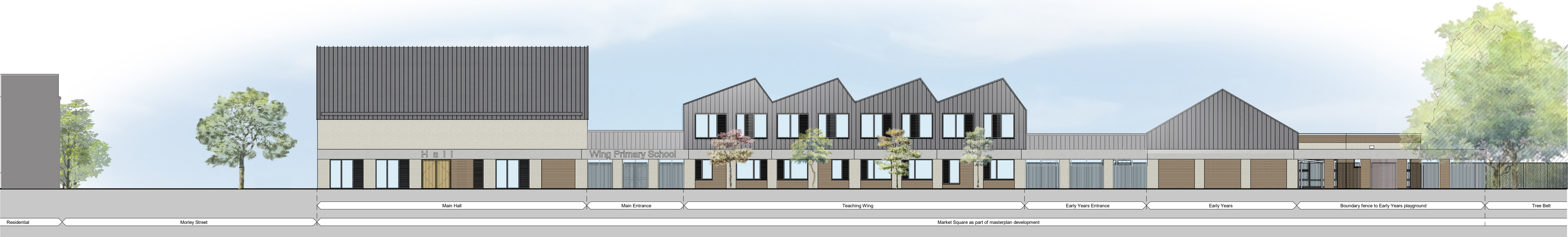
1 South Elevation 1 : 200